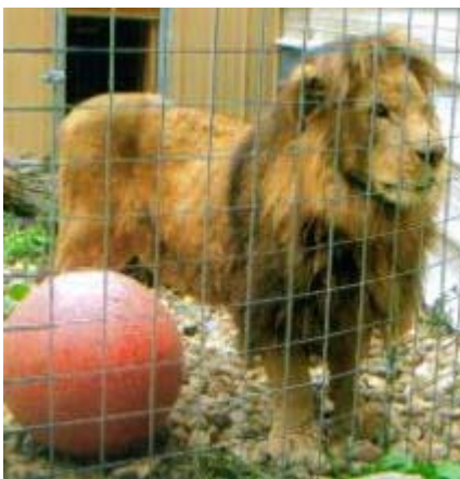
Kovu during his 1 st week at the park.